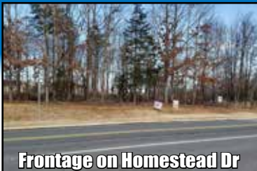
Frontage on Homestead Dr