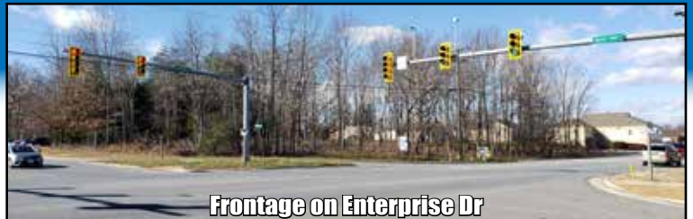
Frontage on Enterprise Dr

SALE SITE: WYNDHURST MEETING PLACE • 105B TRADEWYND DR • LYNCHBURG, VA